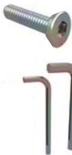
A - 1/4 - 20 Screw x 3